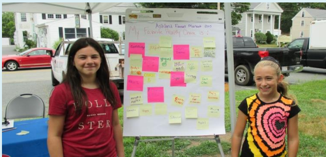
Having fun at the Ashland Farmer's Market

We were happy to have so many families visit the DAET table to share what their healthy choice is!